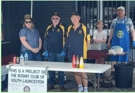
BBQ TEAM LAST SATURDAY.