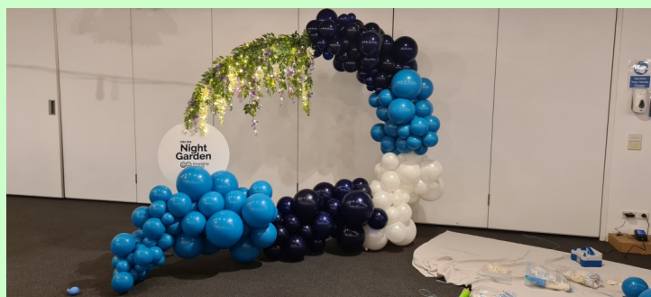
FRIENDSHIP BALL PHOTOS.

Sheep Poo Collection (pulverising, bagging and delivery of aged sheep poo as a garden fertilizer - 500 bags + per year).