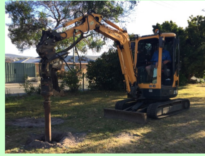
WORK UNDERWAY AT MRC GARAGE.