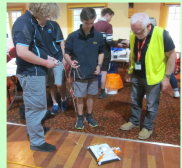
SCENES FROM THIS YEAR'S SCIENCE & ENGINEERING CHALLENGE