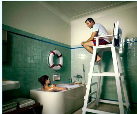
LIFEGUARDS WORKING FROM HOME