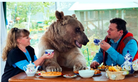
ZOOKEEPERS WORKING FROM HOME