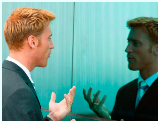
THERAPISTS WORKING FROM HOME