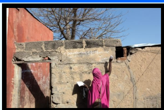
Volunteers vaccinate children in Maiduguri, Nigeria, against polio, marking the houses they've visited.