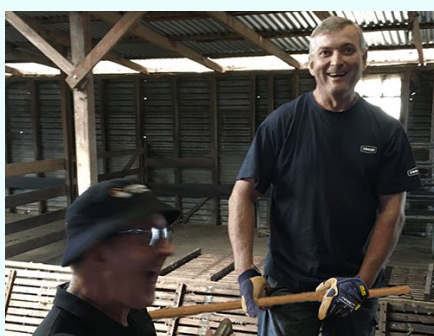
The Bag Ladies!